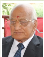
Mahatma Satyanand Munjal 24 May 1917- 14 April 2016