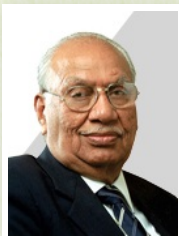
Sh. Brij Mohan Lall Munjal 1 July 1923 - 1 November 2015