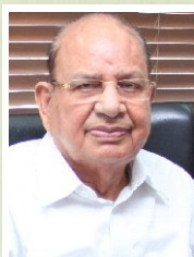
Sh. O. P. Munjal 26 August 1928 - 13 August 2015